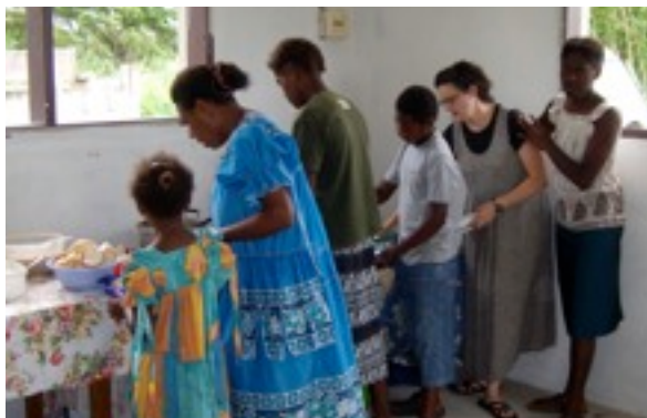
Ladies going through the food line getting plates for all the children present at the fellowship meal.

Due to the completion of the water lines at the church building as