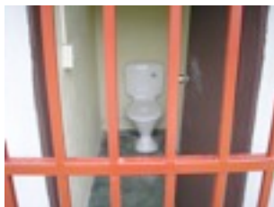
The toilet, seen through the iron security gate.

After a 10 month hiatus, we're back at work on the grounds of the church in the capital city. And as Mike said to me one day in early September, "it sure is nice to see progress again." It was agreed by the men of the congregation that it was indeed time to move ahead. We all felt as though we had done all that was possible, and believed we could no longer allow problems to hinder the church and her work.