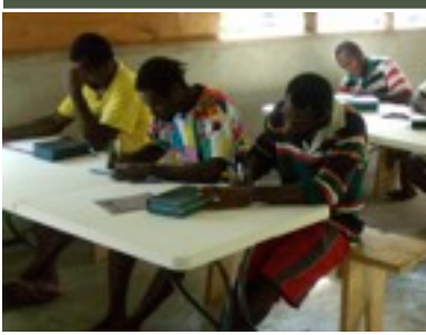
Students taking their first quiz

in Term 2 in Vila. I am especially excited to have three students from Eton Village in the classes. I pick them up each morning as I pass through the village, and then drop them off on the way back home. Our team has unfortunately not been able to have much interaction with the church in Eton due to the disposition of one of the congregation's leaders, but this effort has opened a door to assist that congregation in a seemingly significant way. Additionally, there are six Christians and two non-Christians from Epau attending the classes. [NOTE: On Sunday, March 1, those two non-Christians were baptized into Christ as a result of their studies - more on that great news next month!]