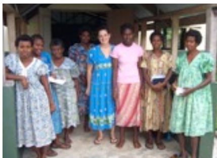
Ladies' Fellowship Meeting

The Epau congregation was started several years before our arrival through the joint effort of local Christians from Eton Village and American missionaries, which means it is one of the older and more mature congregations in the country. As I work with the brethren there, I continually try my best to insist that I have an assistive role as much as possible (rather than a leadership role). In the past, this has made for some slow-going due to a lack of leadership. However, the men and women of the church in Epau have taken some exciting steps forward this month, and we are eager to assist them with their ideas.