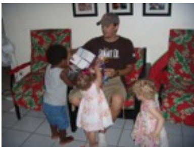
Happy Birthday, Dad

Thanks again for all you do, and we hope to hear about you and yours as you have the time!