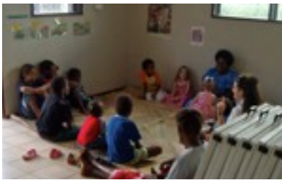
Kids meeting to sing and hear a Bible story before worship in Vila