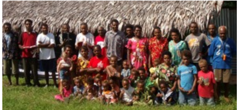
Sunday AM crowd in Etas Village