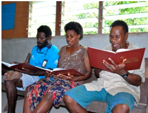
Christians in Epau singing from the new hymnbooks

I set out on this journey in an effort to facilitate worshipping “in Spirit,” as many Christians here do not fully comprehend the English words we traditionally sing during worship. I was pleased with the reception the books received from the local brethren. Singing new words to old tunes is not easy, especially when most aren’t really used to reading the Bislama language. It was gratifying to hear all of the positive comments from local Christians stating how much they appreciate having a quality songbook in their own language. I pray that these books will be used for many years to bring glory to God in songs of praise.