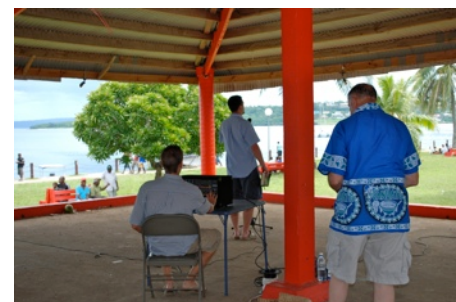
Preaching in the Park