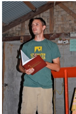
Presenting the new books to the church in Eton.